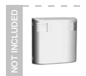
Room temp. sensor