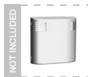
Room temp. sensor